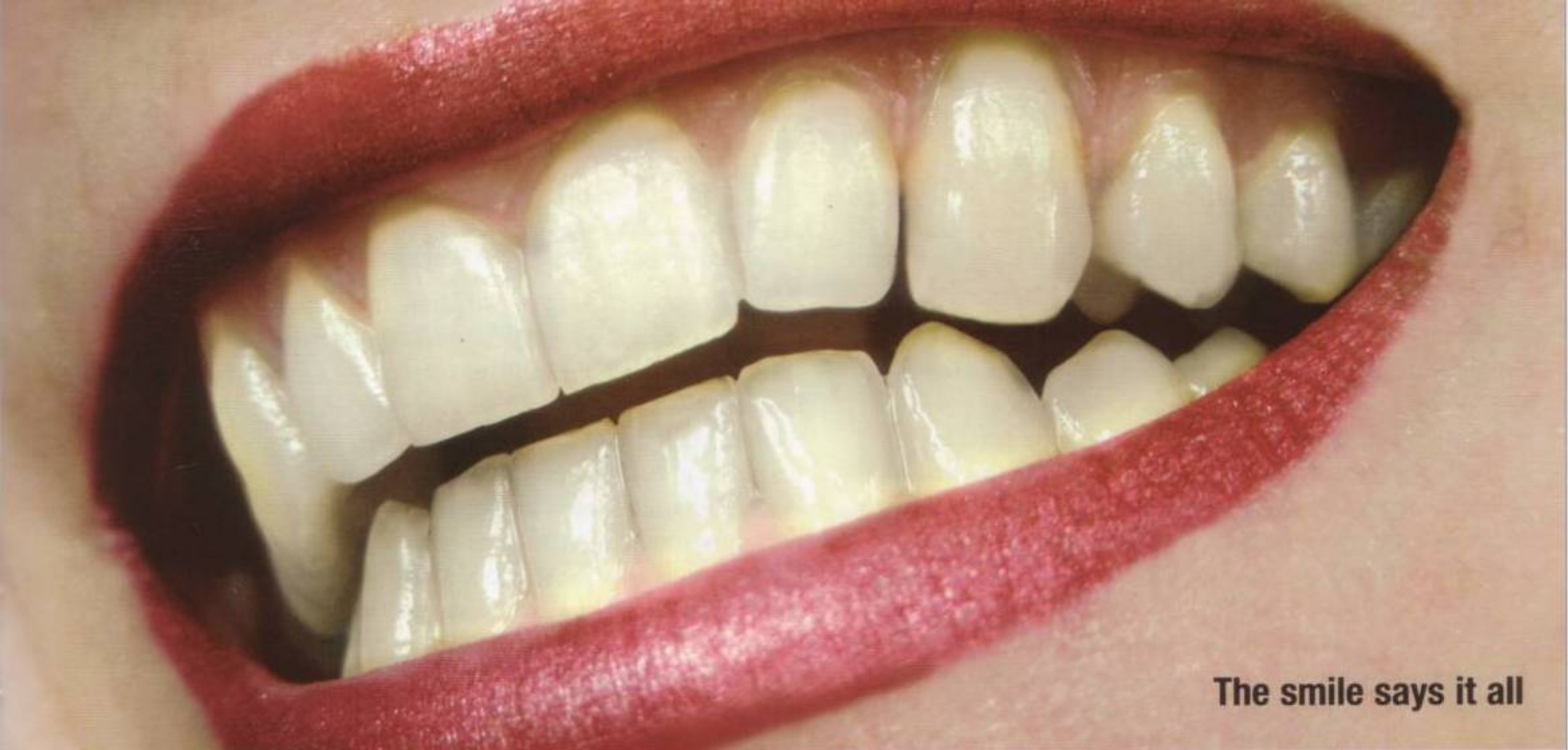
The smile says it all

titanium posts called abutments are connected to the implant to allow support for the replacement tooth or teeth. They should only be placed in a healthy mouth so other remedial treatment may be required.